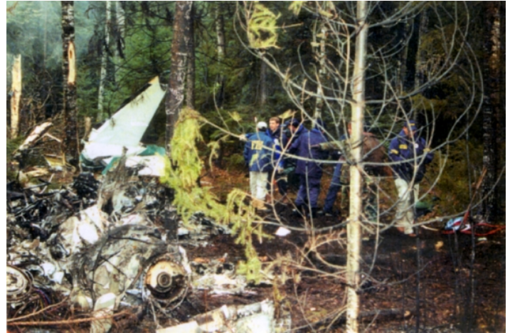
Another view of the crash site, with both FBI and NTSB personnel on the scene.