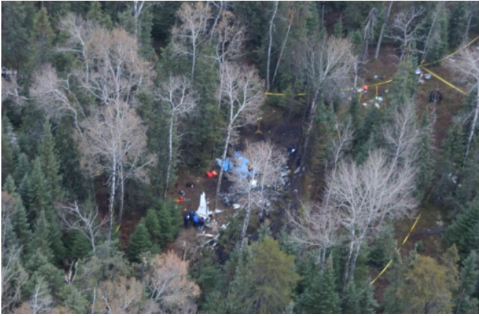
Aerial view of the crash site, reportedly taken the day after the accident from a State Police helicopter, at the request of the NTSB.

looking for the plane 26 —only to return for a closer look and to realize that it was, indeed, the crashed aircraft. 27