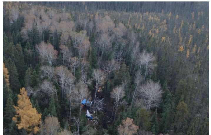
Another aerial view of the crash site, taken from slightly further away. The NTSB never explained why the pilots turned the plane south - away from the airport - in the last seconds of the fatal flight. This photo suggests that they chose this grove of less-sturdy trees to soften their crash landing. The NTSB found that the plane descended through the trees with wings level, but at a steep angle of 26 degrees.